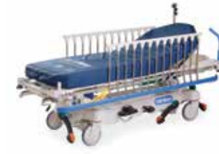
HILL-ROM® PROCEDURAL STRETCHER WITH ENHANCED SAFETY SIDERAILS