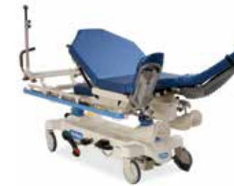
HILL-ROM® OB-GYN STRETCHER