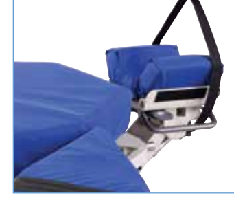
Head Restraint Strap product no. P449