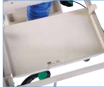
Utility Tray product no. P297B01 (Standard Width 26") product no. P297B02 (Wide Width 30")