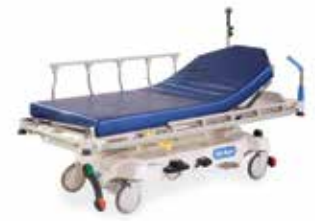
HILL-ROM® TRANSPORT STRETCHER