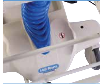
Paper Roll Dispenser product no. P364AT01 (Standard Width 26") product no. P364AT02 (Wide Width 30")