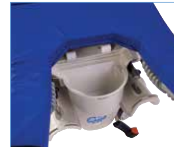
Detachable Catch/Fluid Basin product no. P265