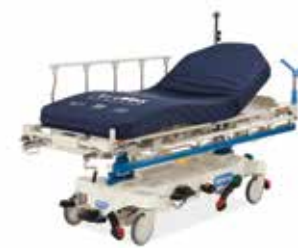
HILL-ROM® PROCEDURAL STRETCHER