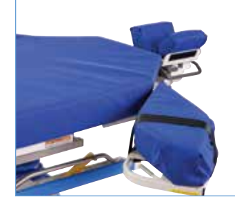
Integrated PACU Extenders product no. P261ECP