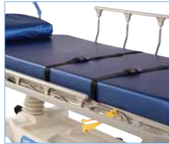
Transport Strap product no. P349