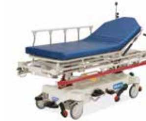
HILL-ROM® TRAUMA STRETCHER