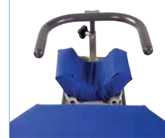
Superior Wrist Rest product no. P262A01