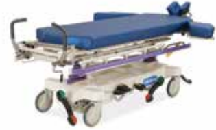
HILL-ROM® SURGICAL STRETCHER

700 lbs — Weight capacity of all Hill-Rom® Stretchers