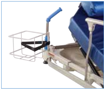
Liquid Oxygen Tank Holder product no. P273