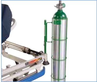
Vertical Oxygen Tank Holder product no. P27601 (Mounts in IV sockets)