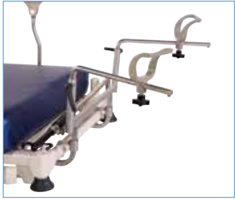
Ankle Stirrups product no. P347AT (Folds away when not in use)