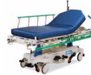
HILL-ROM® PROCEDURAL STRETCHER WITH INTELLIDRIVE® POWERED TRANSPORT