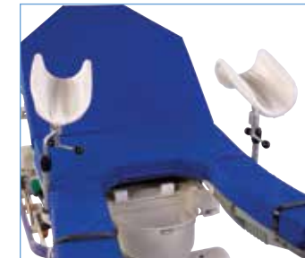
Telescoping Calf Supports product no. P35745AT