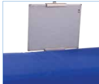
Lateral X-Ray Cassette Holder product no. P264