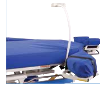
Gas Delivery/Drape Support Device product no. P263