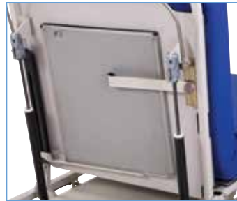
Upright Chest X-Ray Cassette Holder product no. P279AT