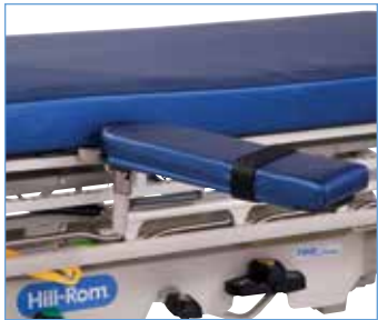
Armboard product no. P344CT