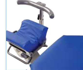
Temporal Wrist Rest product no. P262A02 (Mounts on left or right side)