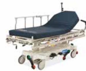
HILL-ROM® ELECTRIC STRETCHER