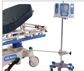
IV Transporter Device product no. P491