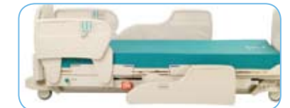
High Quad Filled