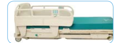
High Long Rail