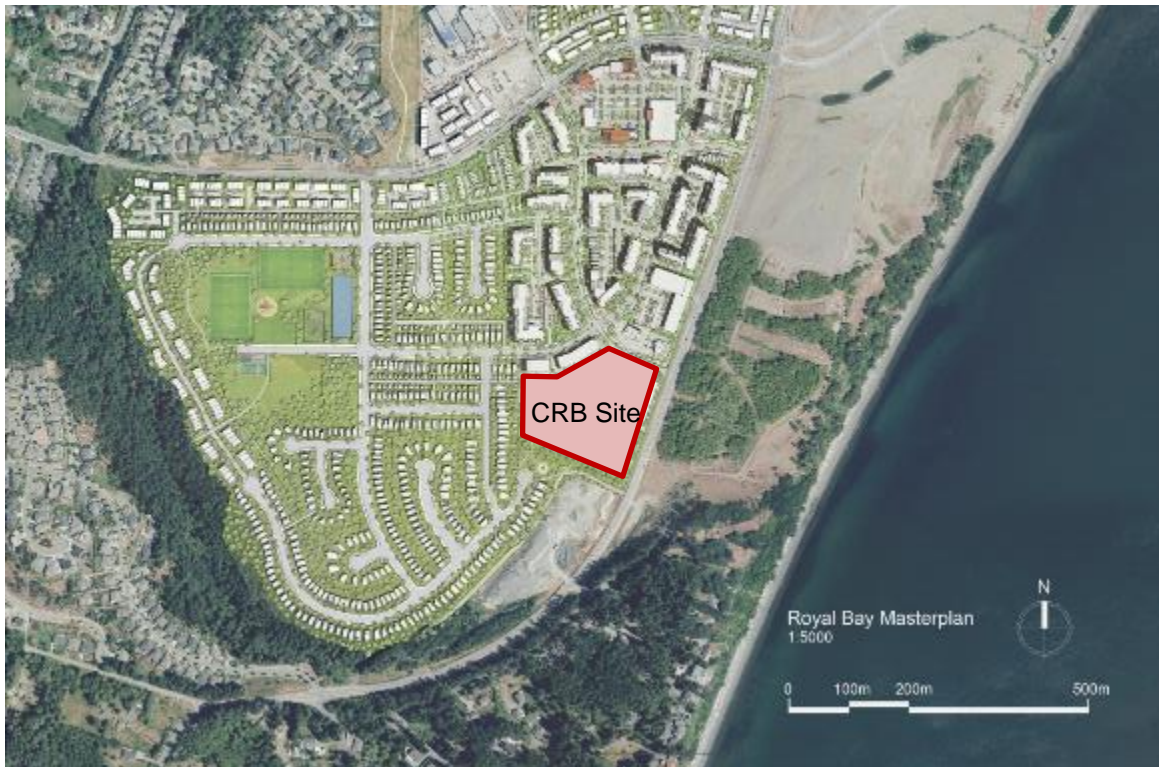
Figure 2: Site within Royal Bay Community Master Plan

The Project Site fits into the Royal Bay community's master plan as shown in Figure 2, bordered to the north by Ryder Hesjedal Way and to the east by Metchosin Road. The current zoning is Comprehensive Development 28 (CD28), which is appropriate to accommodate the Project.