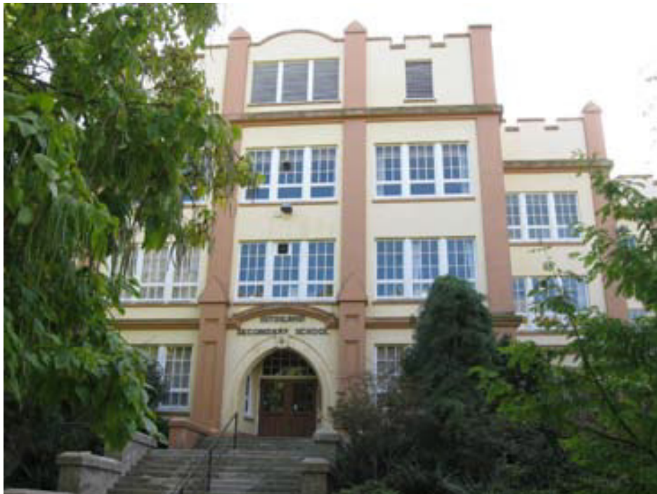
Figure 1: Main Entrance Constructed in 1927

To aid with the development of the Project scope and decision-making process, planning principles have been established for the Project. These include: