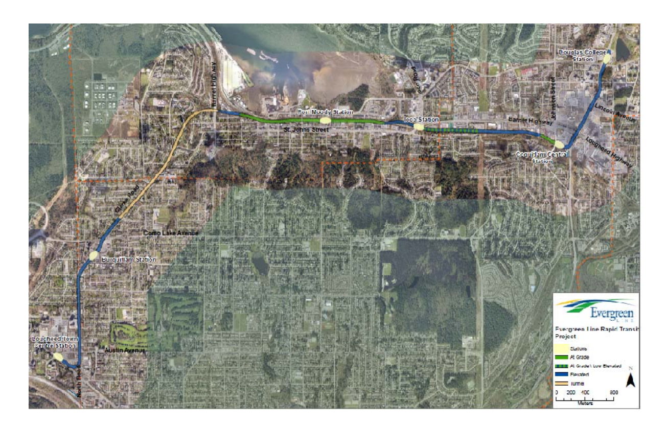
Figure 1 – Physical Scope

The physical scope of the Project is illustrated in Figure 1 below.