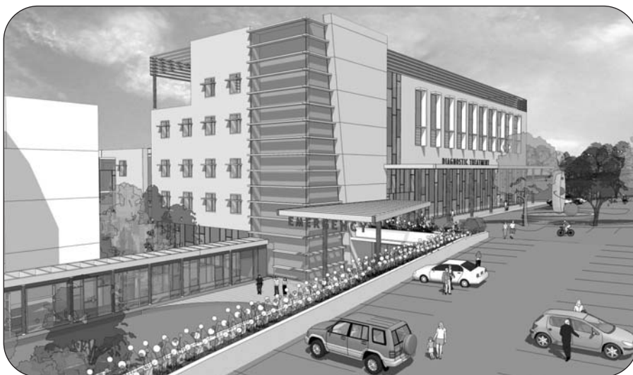
Vernon Jubilee Hospital Patient Care Tower Emergency Entrance

As a centre of PPP procurement expertise, Partnerships BC continues to develop best practices. Partnerships BC continually transfers knowledge and experience gained from past projects to others, to improve efficiency and quality, and to streamline and expedite the procurement process to save time and money for the public sector. Partnerships BC is represented on the steering committees for all PPP projects to ensure the application of sound governance principles and best practices. For example, the use of certain procurement documents across health care projects, including the KVH project, has resulted in the reduction of certain procurement-related costs. Procurement expertise is shared with ongoing knowledge transfer between projects in the various sectors.