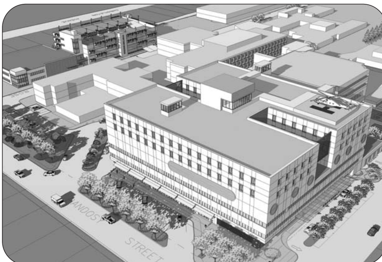
Kelowna General Hospital Patient Care Tower