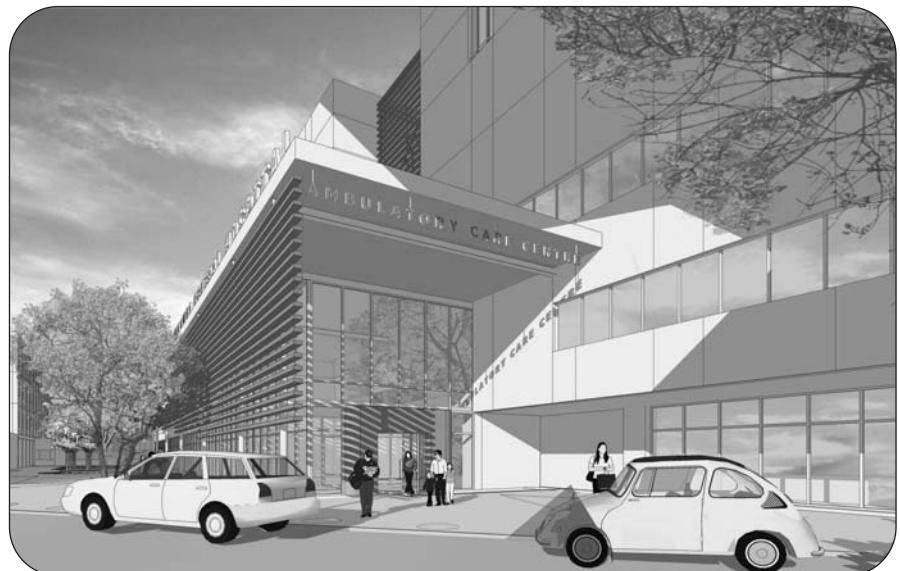
Kelowna General Hospital Patient Care Tower Main Entrance