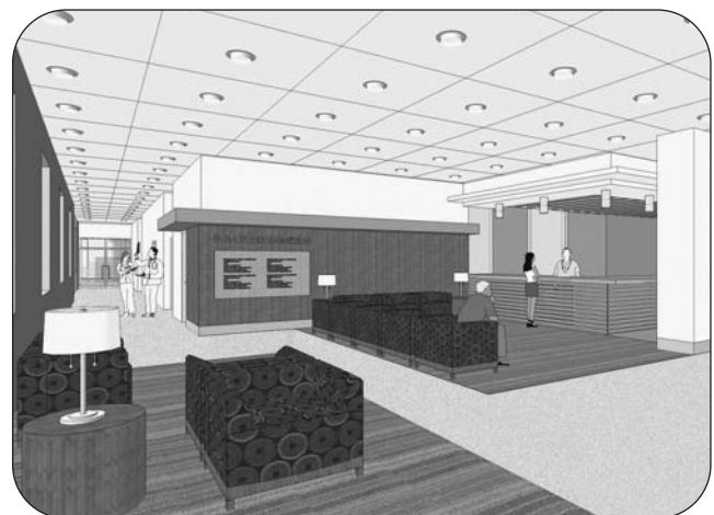
Vernon Jubilee Hospital Patient Care Tower Interior

Once construction is complete and occupancy permits are in place, IHA is responsible for paying Infusion Health annual service payments for 30 years. IHA is responsible for making monthly payments to Infusion Health based on performance, facility availability and service quality. Infusion Health’s performance will be continuously monitored throughout the operating period based on key performance indicators, and IHA may make deductions from the monthly payments if Project Agreement standards are not met.