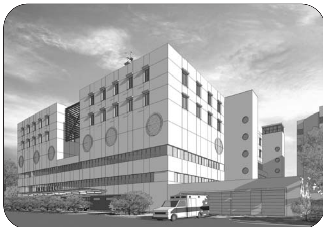
Kelowna General Hospital Patient Care Tower Ambulance Entrance

The project was originally announced in the spring of 2007 of a capital value of $200.1 million. In September 2007, the capital value was revised to $251.1 million. As a result of the changes described above, the final total capital cost has increased by $181.8 million.