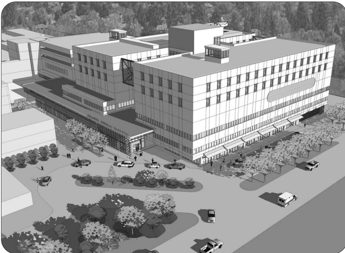
Kelowna General Hospital Patient Care Tower