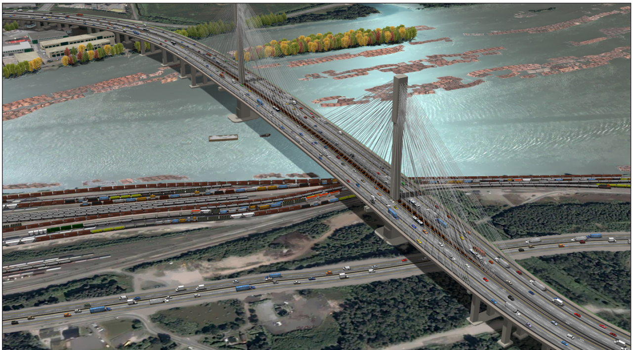
Artists rendering of the new 10-lane Port Mann Bridge. The new bridge will accommodate new Highway 1 RapidBus service, providing service between Langley and Burnaby in 25 minutes or less. The bridge will also be built to accommodate future light rail rapid transit.

Open road tolling systems generally require users to possess an electronic tolling device, such as a transponder, linked to a credit card allowing tolls to be automatically charged when the user travels. Traditionally, users without an electronic tolling device are required to pay a higher rate, or not use the system at all. However, key to the Port Mann/ Highway 1 Improvement Project was ensuring all users would qualify to pay the lowest possible rate. This necessitated creating options for vehicles without a transponder to pay the minimum toll rate. These options include permitting these users to pay in advance of travel or to pay in a timely fashion following use.