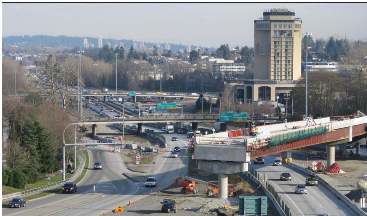
Construction of westbound HOV ramp to Grandview Highway. This upgraded connection will provide significant benefits to users such as improving safety and accessibility.

Other elements of the proposed tolling structure include: