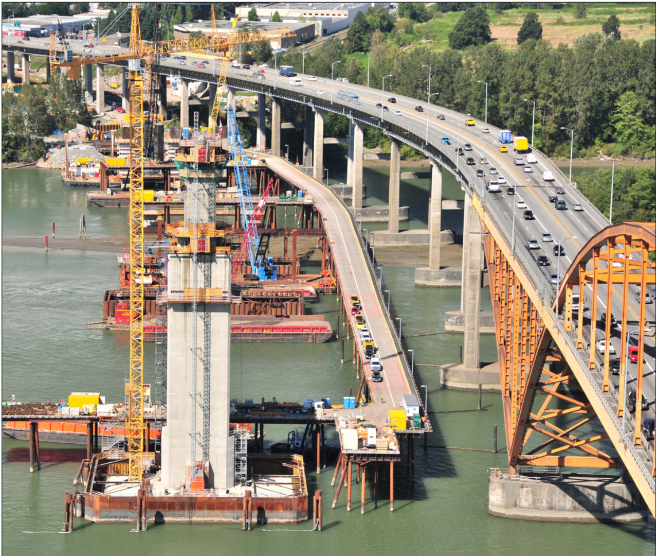
Construction of the north tower. This is one of the two towers, rising 158 metres from the water that will be supporting the cable-stayed main bridge.