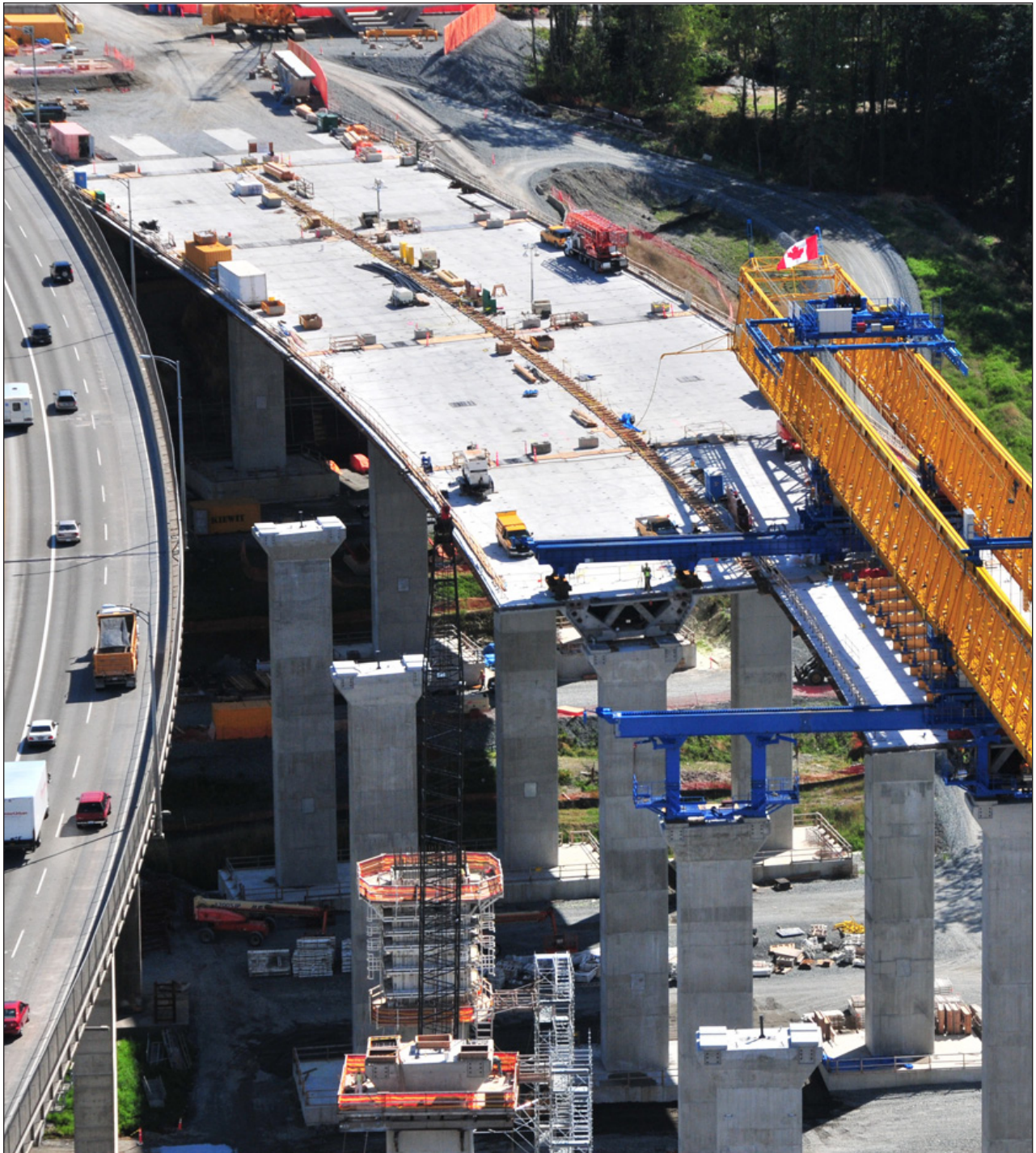
Completed sections of the new bridge deck and the gantry crane. The new Port Mann Bridge will be operational by December 2012.

On this basis, the Province was able to incorporate many of the benefits of the DBFO procurement process that had been realized to date, including the innovation of the single bridge, and transferring the risk of cost overruns and schedule delays to the contractor.