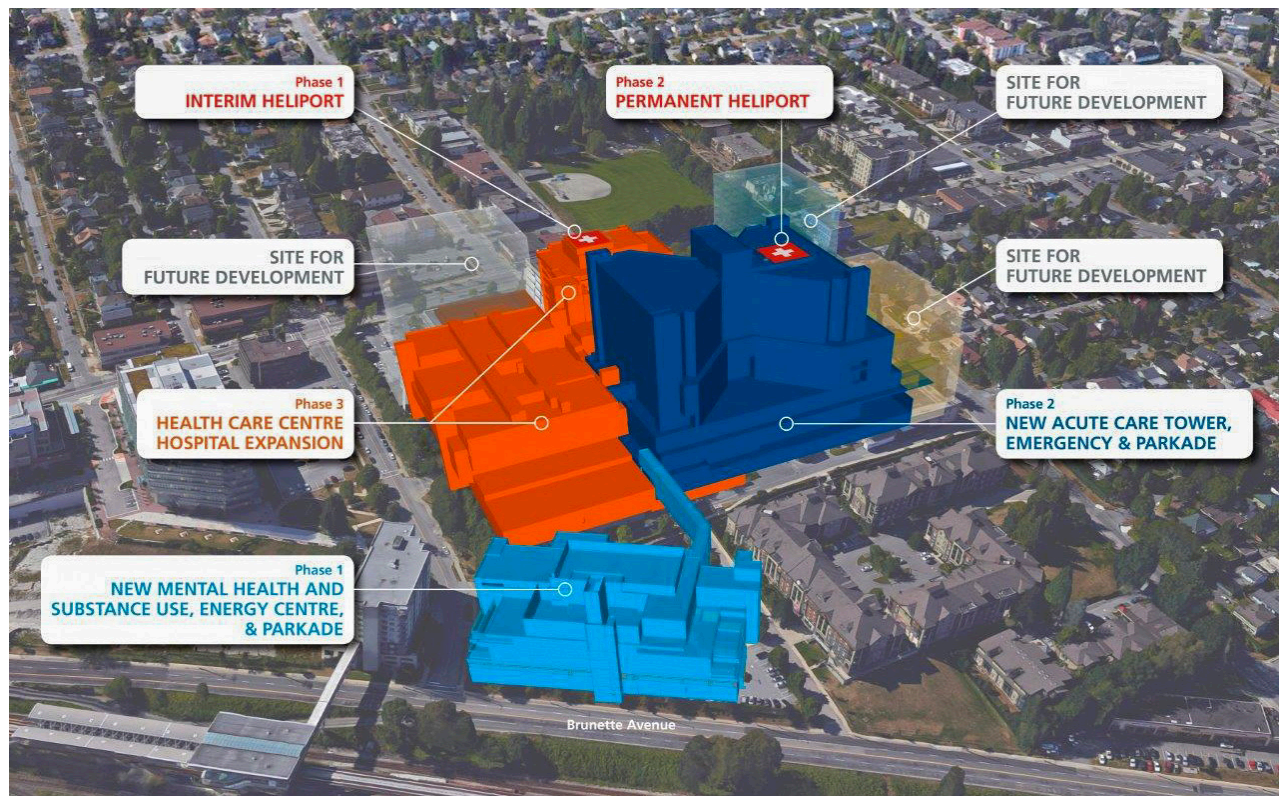
FIGURE 2: RCH REDEVELOPMENT PROJECT PHASES OVERVIEW

A graphic representation of the RCH campus showing Phases One, Two and Three is illustrated in Figure 2 below: