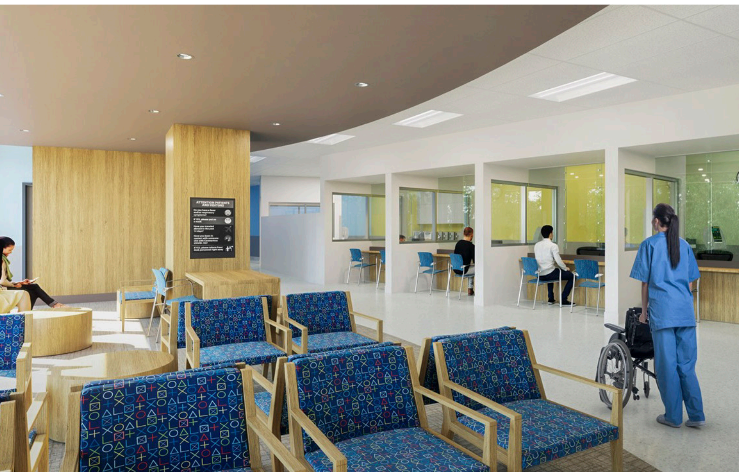
FIGURE 4: ACT TRIAGE RENDERING

Travel distance for staff and patients will be minimized and will help streamline the flow of supplies. The design provides efficient travel distances between key departments, such as operating rooms to patient recovery rooms, and maternity to operating rooms. This ensures that the departments are closely located, which will result in faster response time by staff, improved health and safety for both patients and staff, and improved infection control.