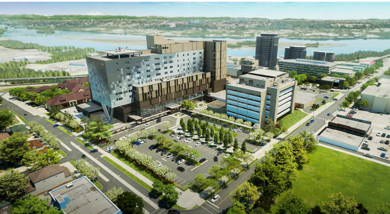
FIGURE 1: PROJECT SITE VIEW RENDERING

The total capital cost of the Project is approximately $1.2 billion. The Project is being funded by the Government and the Royal Columbian Hospital Foundation, with the Government providing majority of the funding.