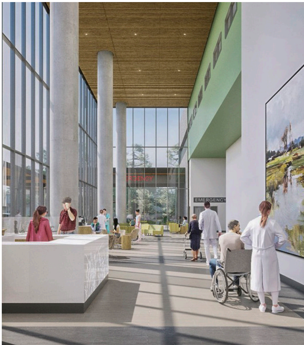
FIGURE 3: ACT LOBBY RENDERING

Natural light and green space have been proven to enhance healing and reduce patients' length of stay in hospitals. Natural and borrowed light will be optimized and incorporated throughout the ACT.