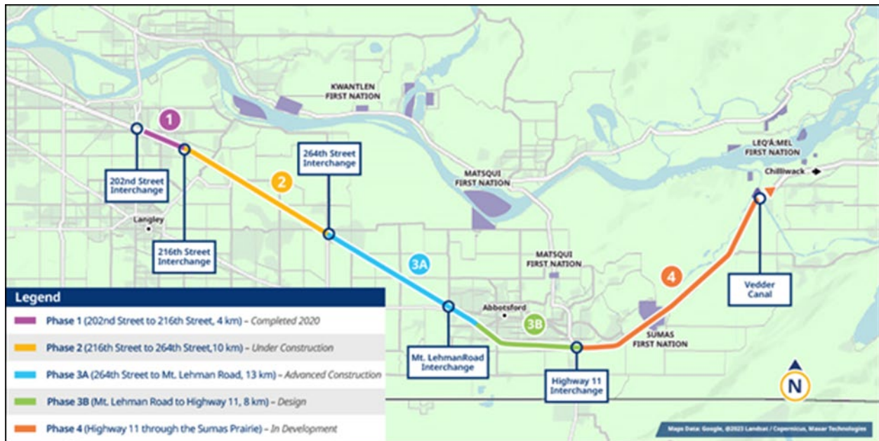
FIGURE 1: FRASER VALLEY HIGHWAY 1 CORRIDOR IMPROVEMENT PROGRAM LOCATIONS

Phase 1: 216th Street Interchange – Complete 2020